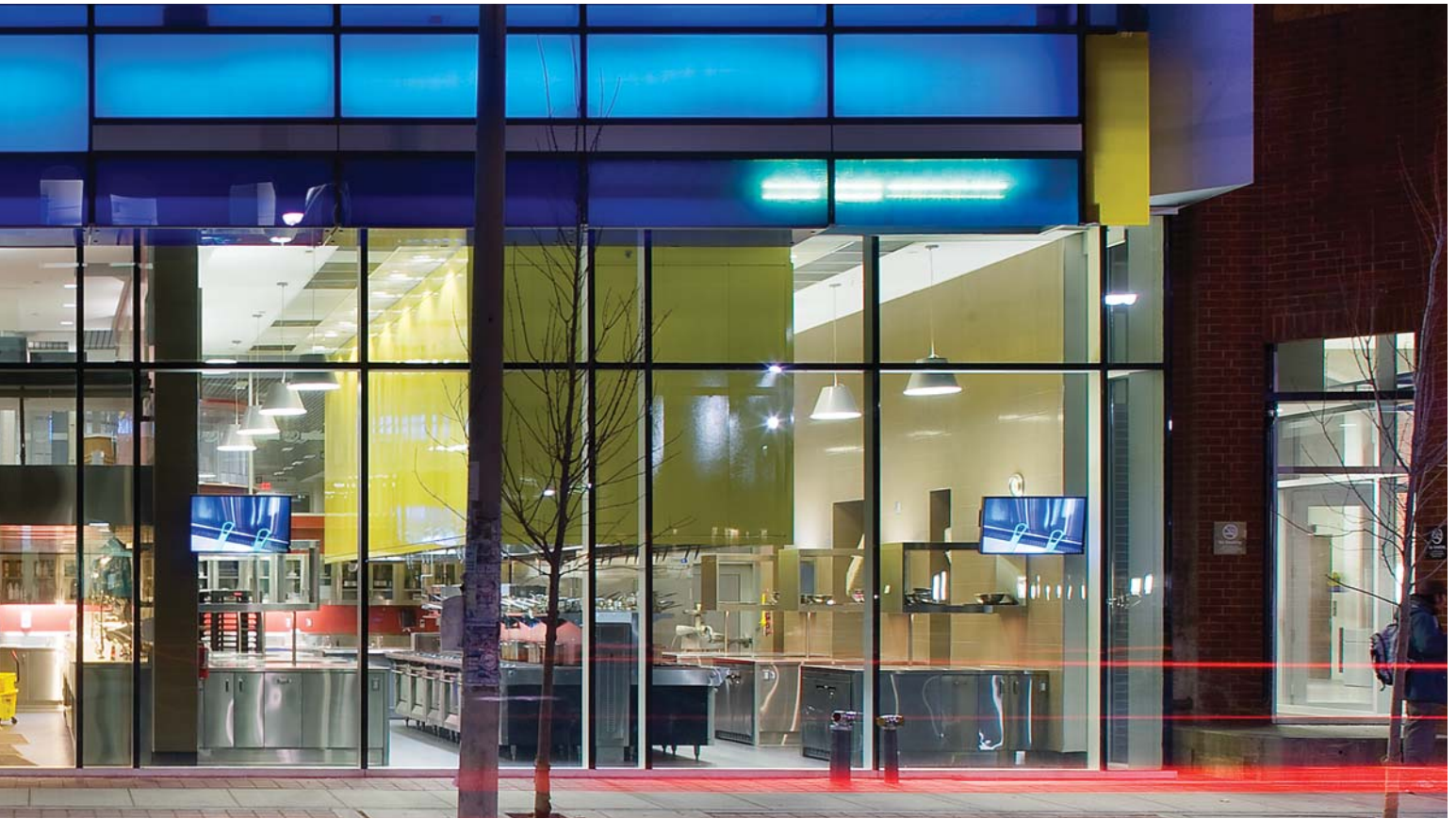
George Brown College, Toronto, Ontario, Canada